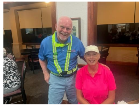
2 nd place