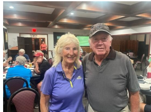
3 rd place