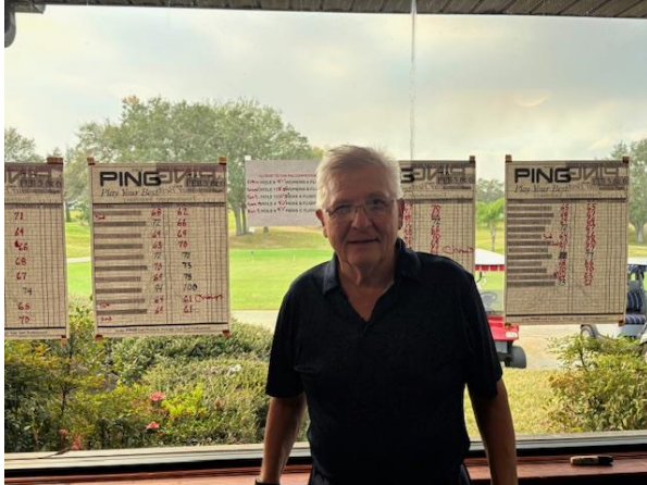
David Maki & David Fitch (no photo) (-14 USGA back 9)