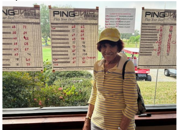
Diane Christie & Linda Hodgson (no photo) (-14 USGA back 9)