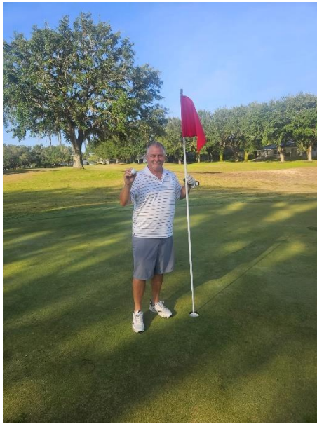
Edelman #18 4/25/25